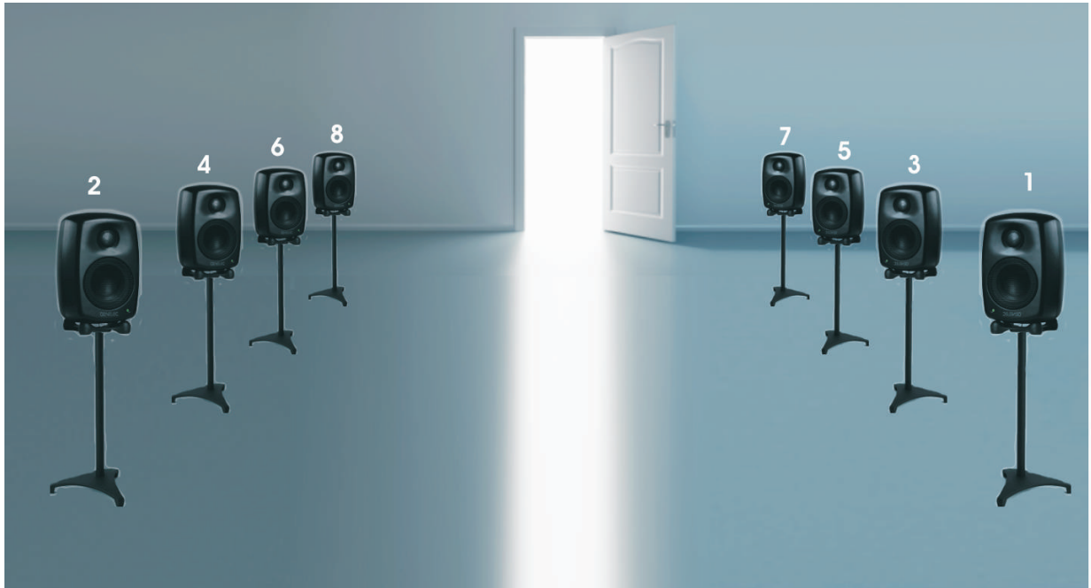
Figure 1. The entrance door and the loudspeakers of the installation.

The figure 1 above shows the basic idea how the sound installation should look like: The entrance door brings the audience in the middle of the installation. Note that the symmetry-line is in the center of the entrance pathway. Also the loudspeakers are symmetrically on both sides of the central line.